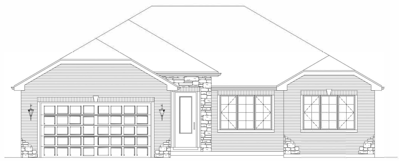
Front Elevation "B"