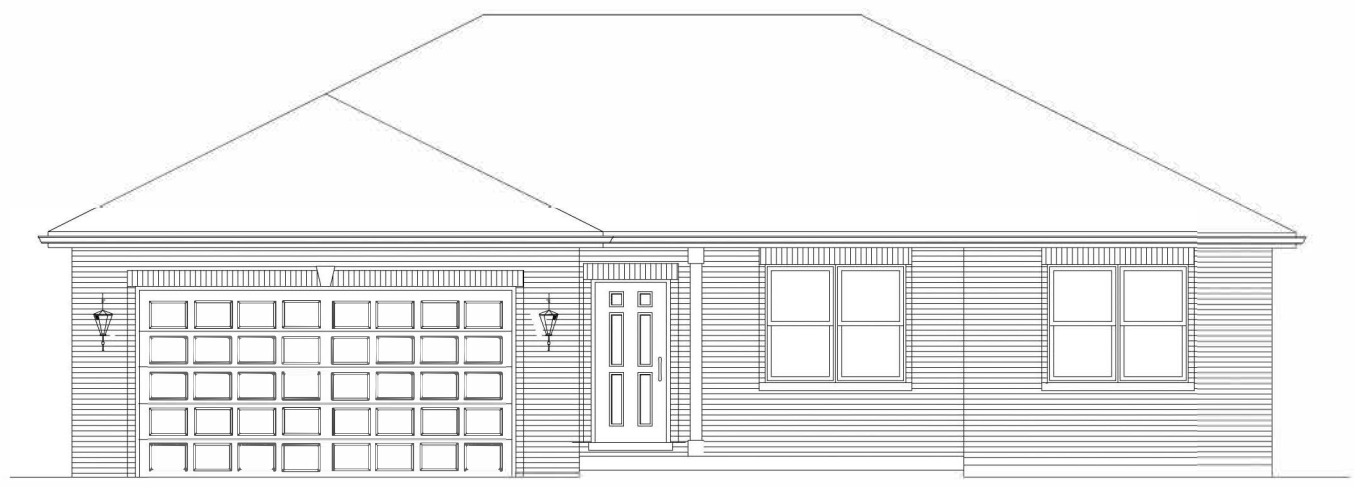
Front Elevation "A"