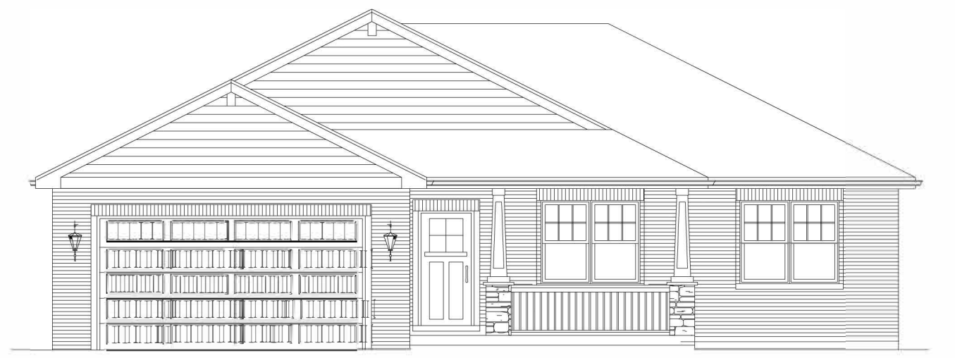
Front Elevation "C"