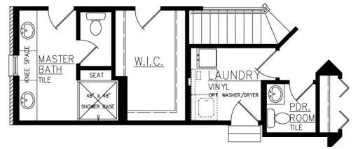
Optional Powder Room Plan